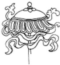
Chattras A parasol - protection against all evil; high rank.