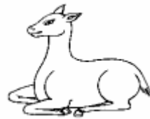
Deer The deer - usually in pairs - symbolizes the first sermon of the Buddha which was held in the deer park of Benares.